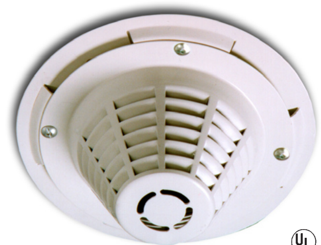
SIGA-DG (Shown with optional mounting flange)