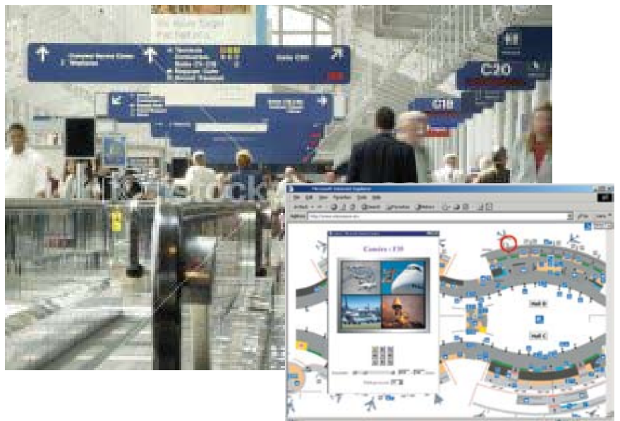
Example of custom user interface

The large scale digital video solution to help protect facilities, assets, passengers, pilots and airport staff